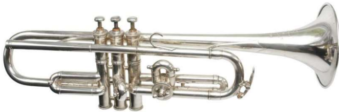
1929 Presentation cornet #16987 is dated 1929 (below, Univ. of Edinburgh).